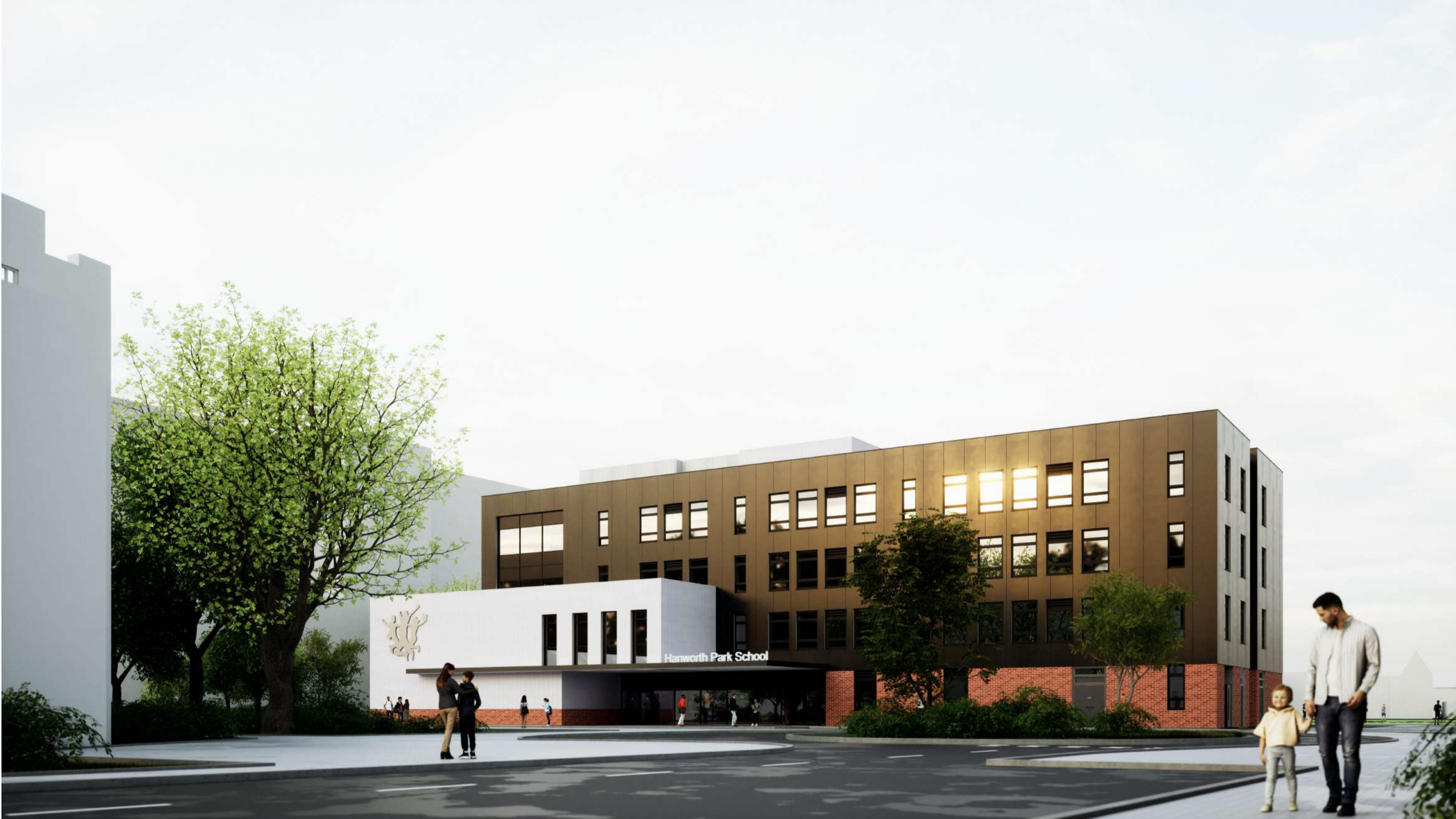
01 - Approach view