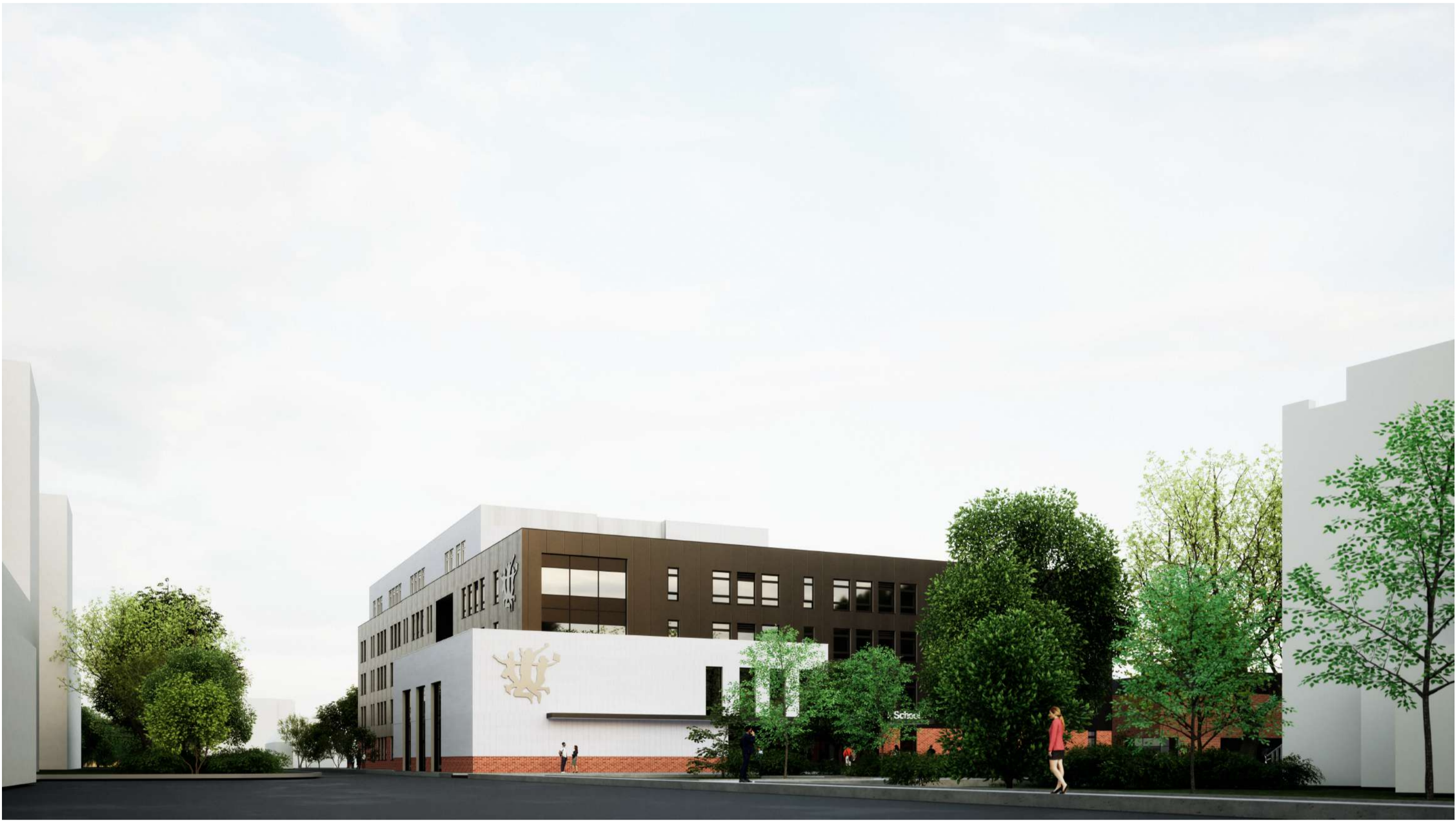
02 - Halls view