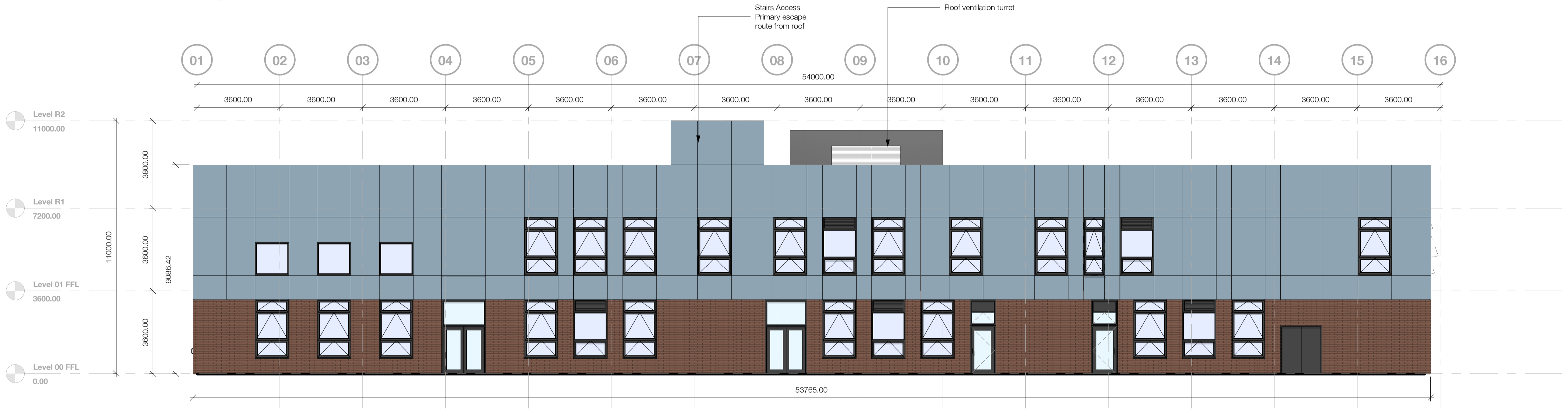
1 South Elevation 1:100