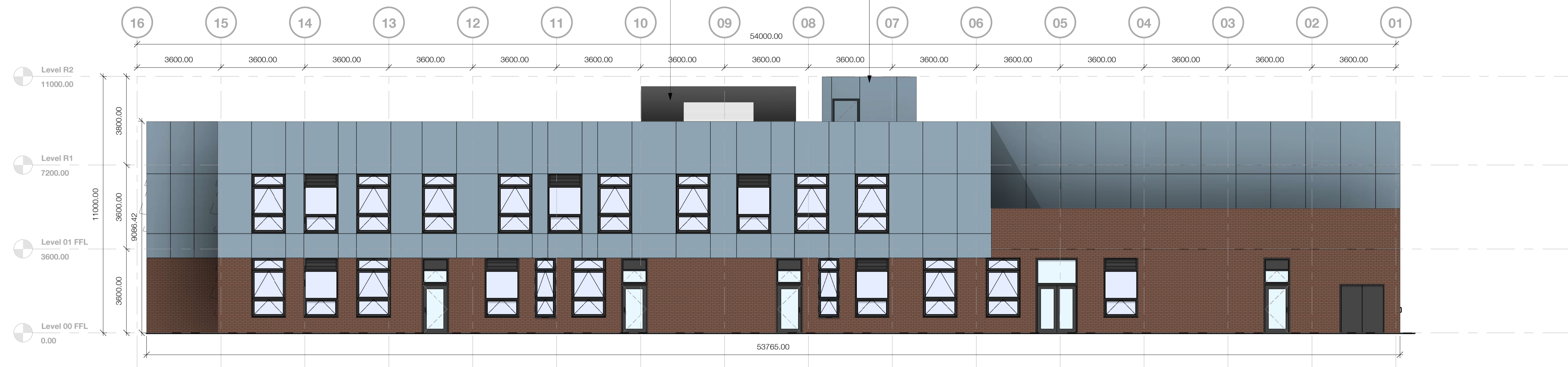
4 North Elevation 1:100