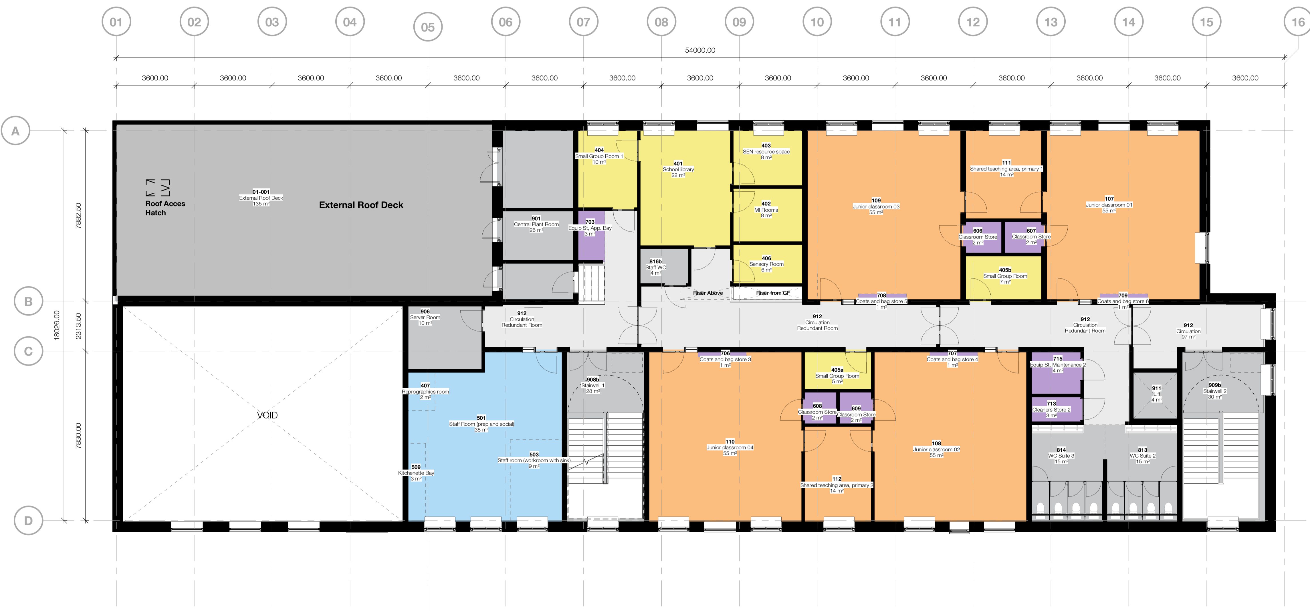
1 GA Plan Level 01 1:100