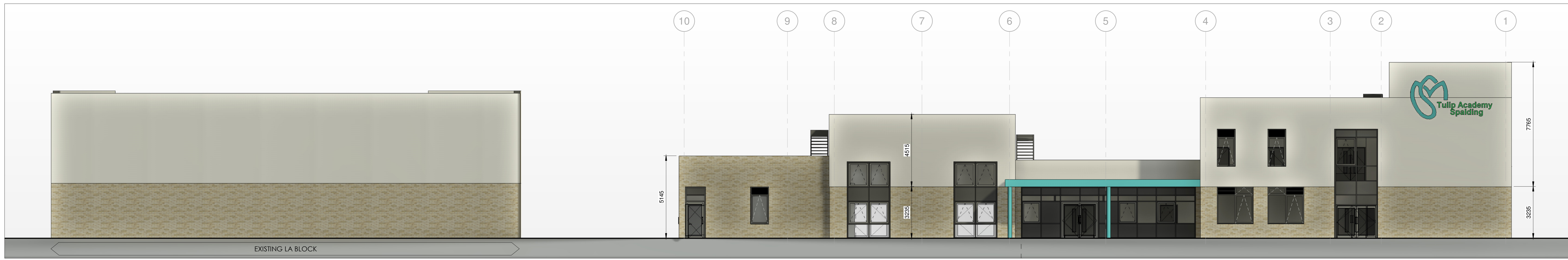
1 North Elevation