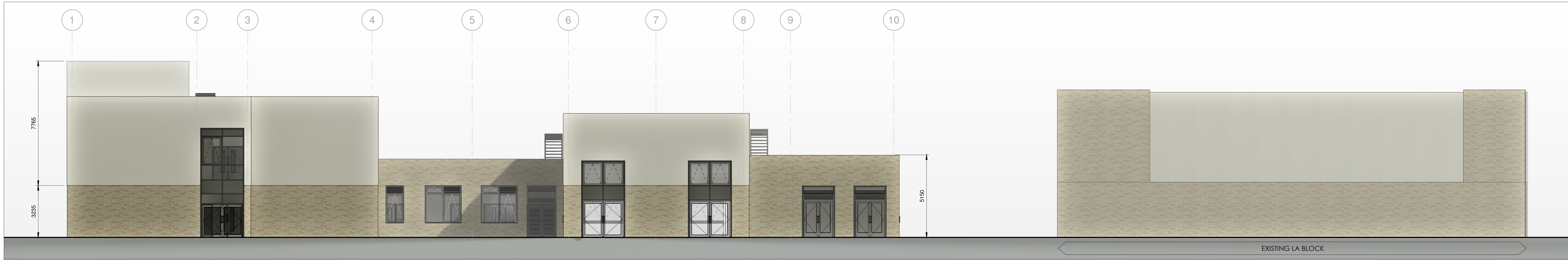
2 South Elevation